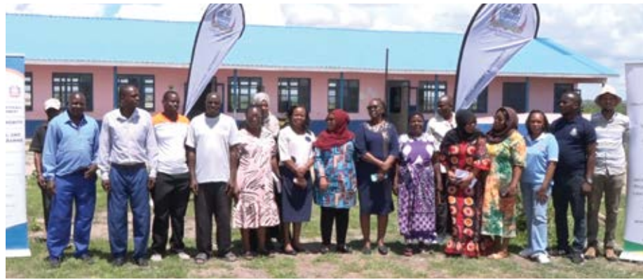
CDA project verification team poses for a group photo with officials at the newly constructed Burangi Comprehensive School in Magarini Sub County, Kilifi County.