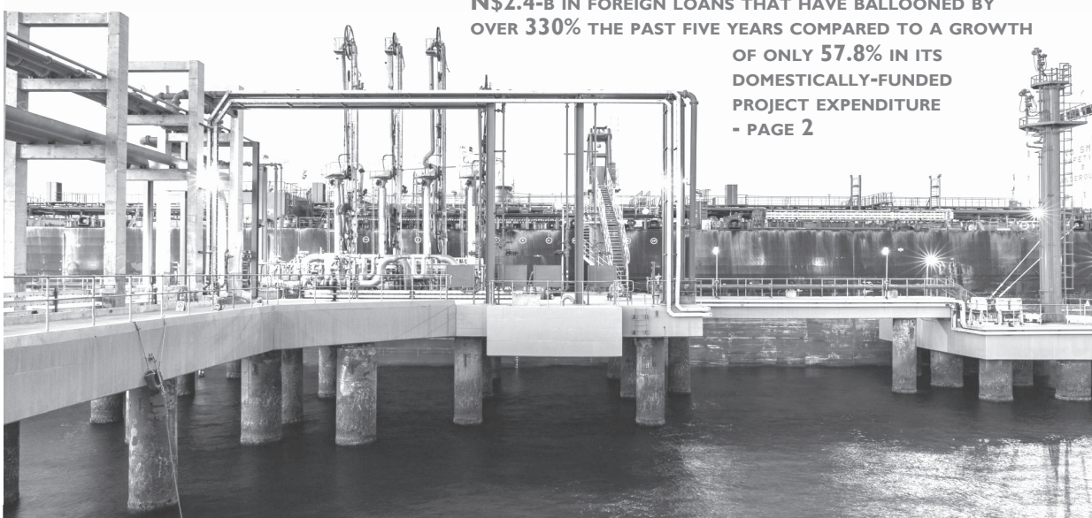
PHOTO: The tanker jetty at the National Oil Storage Facility in Walvis Bay harbour ( https://www.namcor.com.na ).

OF ONLY 57.8% IN ITS DOMESTICALLY-FUNDED PROJECT EXPENDITURE - PAGE 2