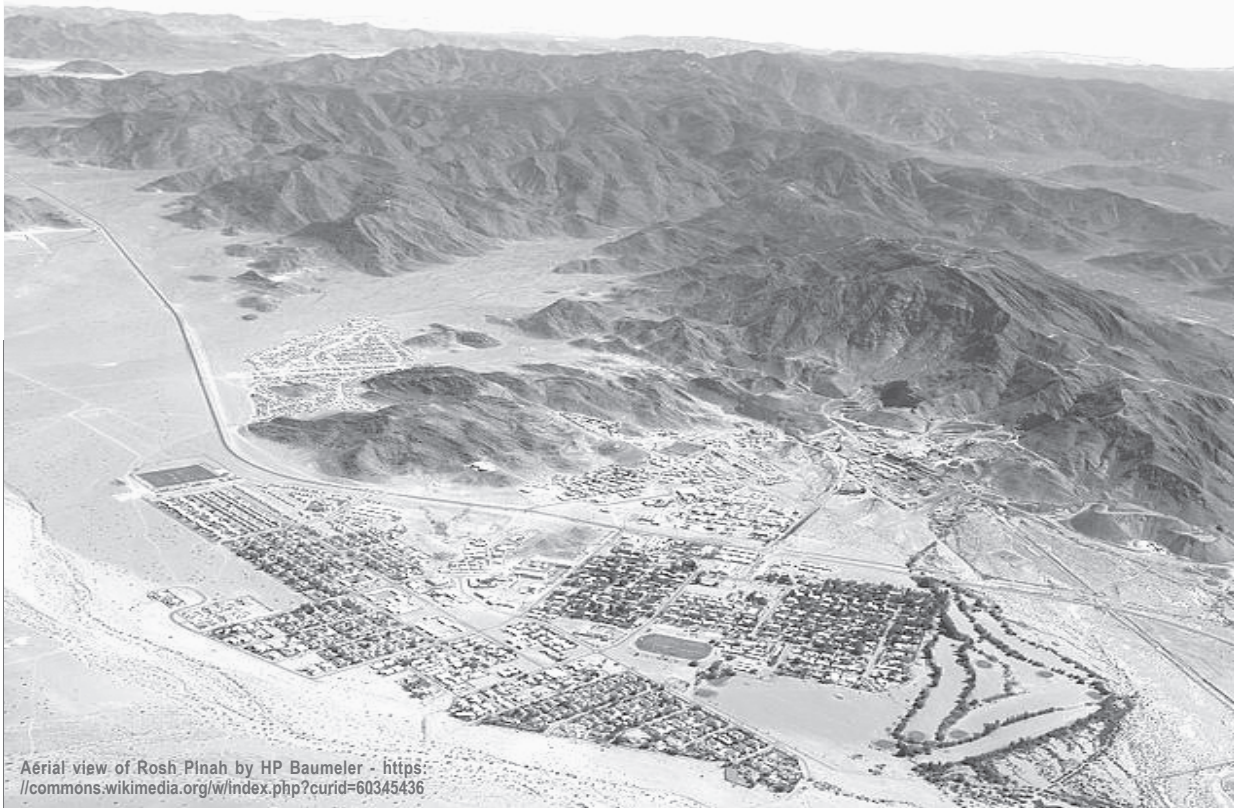
Aerial view of Rosh Pinah

WITH THE LATEST AWARD OF THE TENDER TO BUILD THE ROSH PINAH SOLAR FARM, CHINESE CONTRACTORS ARE IMPLEMENTING FOUR OF NAMIBIA'S BIGGEST POWER PROJECTS WORTH N$5.5-B CURRENTLY UNDERWAY OUT OF SIX TOTALING N$7.2-B - OVER 76% BY VALUE - SOME OF WHICH ARE FINANCED THROUGH FOREIGN LOANS OF AT LEAST N$4.3-B (NOT GRANTS). AND THIS EXCLUDES N$2.44-B NamPower BORROWED FROM THE WORLD BANK IN MAY FOR FURTHER EXPANSIONS TO THE NATIONAL ELECTRICITY GRID - PAGES 2 & 3