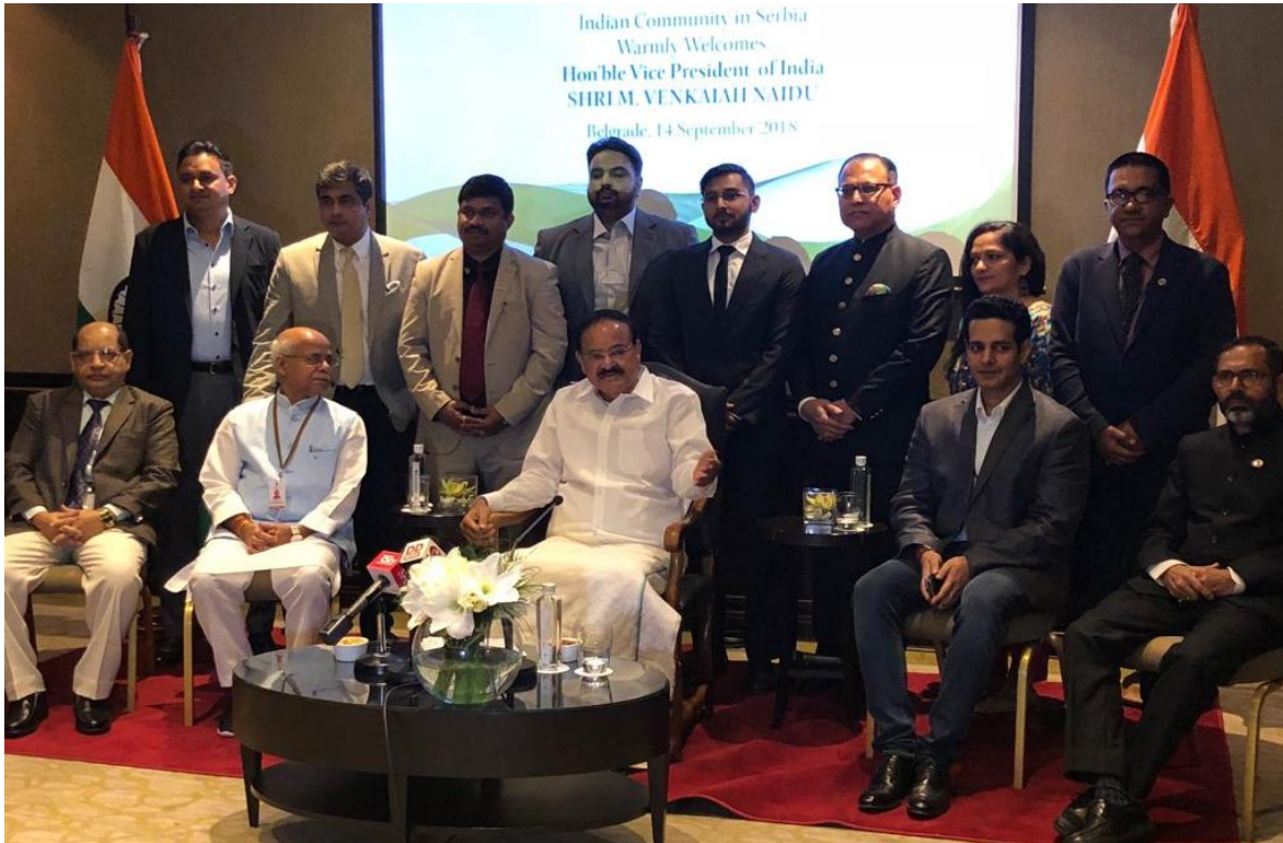
Evening reception with the Indian Community with Shri Venkaiah Naidu, Honorable Vice President of India