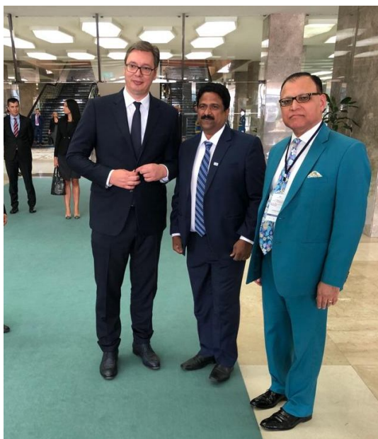
Meeting with H.E. Mr. Aleksander Vucic, President of Serbia