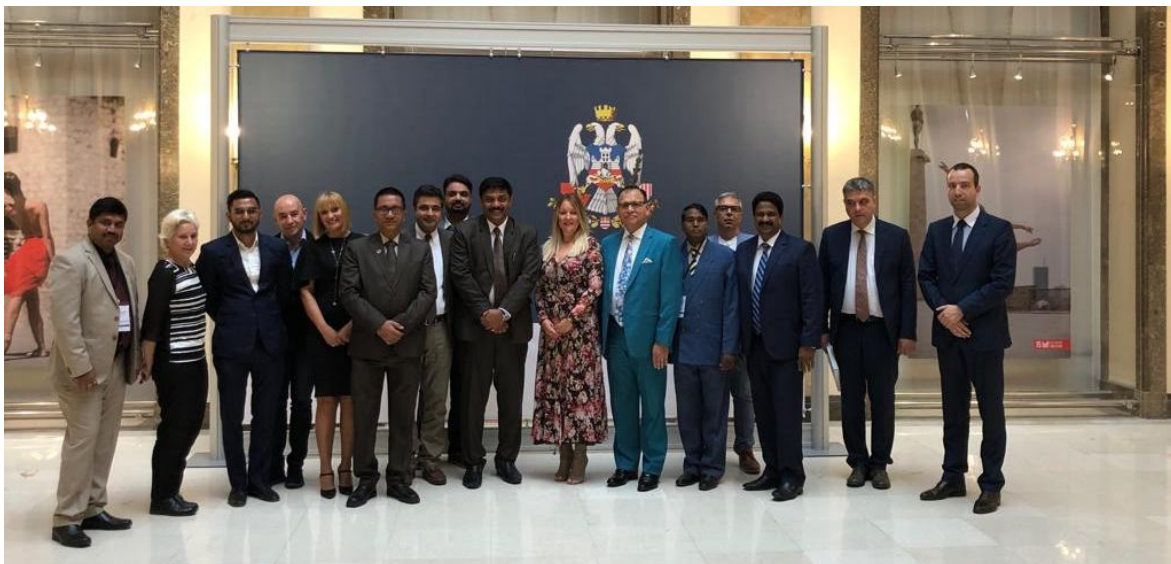
Meeting with the Mayor of Belgrade