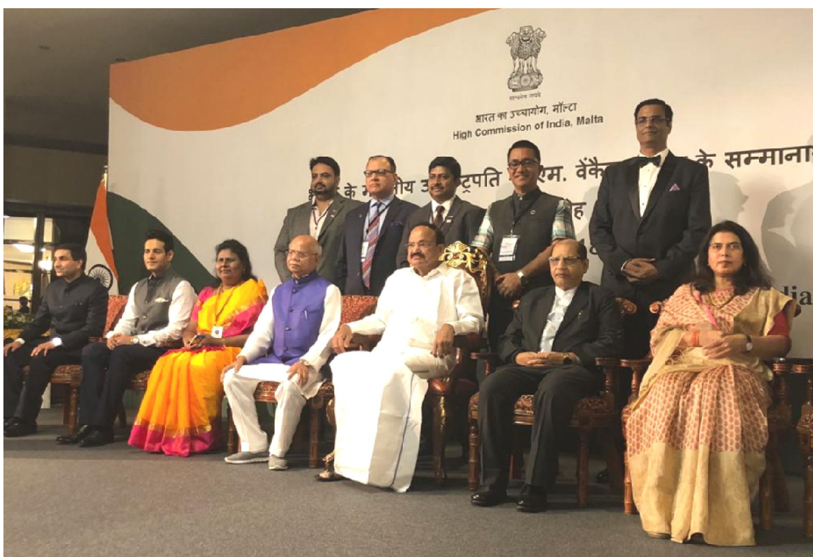
Evening Reception with Shri Venkaiah Naidu, Honorable Vice President of India