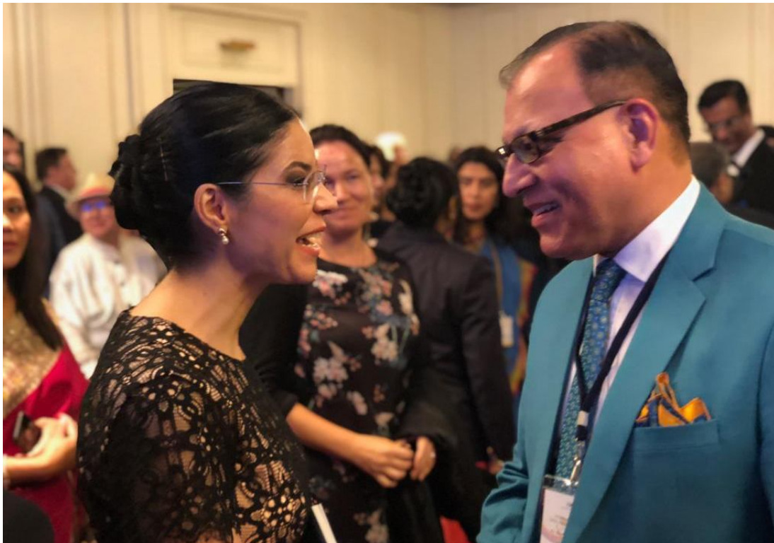
Meeting with Ms. Ana Barchall, Vice Prime Minister of Romania