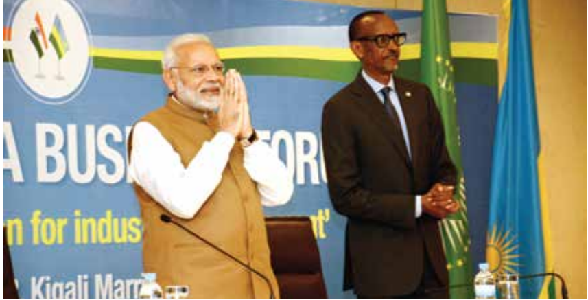
Mr. Narendra Modi, Hon'ble Prime Minister of India with Mr. Paul Kagame, Hon'ble President of Rwanda

PHD Chamber mounted a business delegation to Kigali, Rwanda and Kampala, Uganda, July 23-25, 2018 coinciding with the visit of Mr. Narendra Modi, Hon'ble Prime Minister of India. The delegation participated in business events in these respective countries. The business events were attended by the who's who of the industry, Ministers, Bureaucrats and other decision makers from India, Rwanda and Uganda. The participants represented various sectors of the economy including agriculture and food processing, oil and mining, gems and jewellery, automobiles & ancillaries and pharmaceuticals.