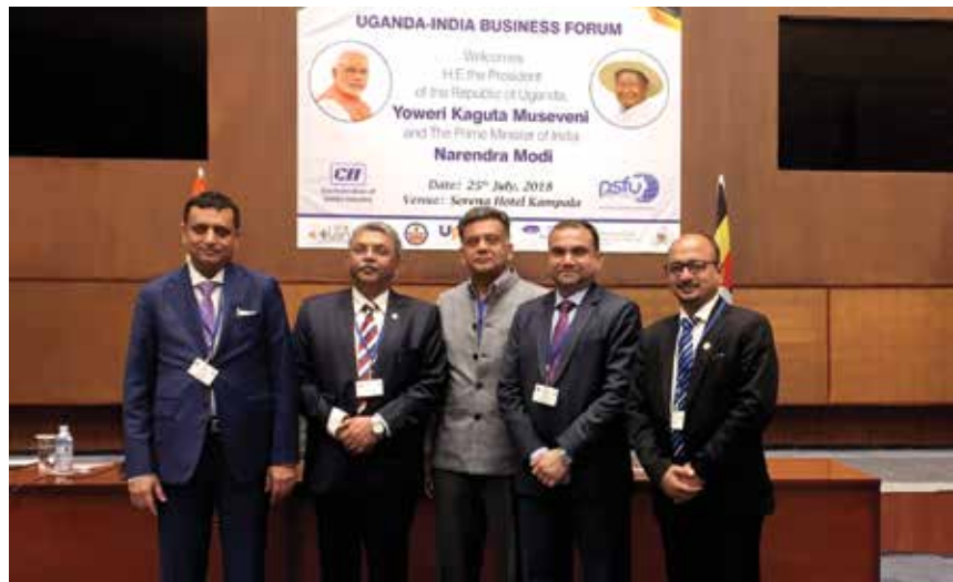
PHD Chamber Delegates

It was highlighted that the current visit of our Hon'ble Prime Minister to Rwanda, Uganda and South Africa is indicative of