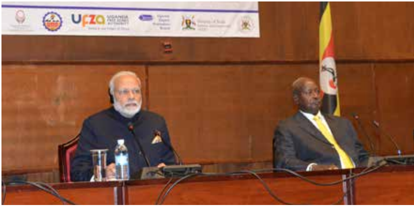
Mr. Narendra Modi, Hon'ble Prime Minister of India and Mr. Yoweri Museveni, Hon'ble President of Uganda

Deepening cooperation with Rwanda in the fields of trade, defence, culture and agriculture, Hon'ble Prime Minister Narendra Modi gifted 200 cows towards transforming the economic life of a village. India and Rwanda also signed a defence cooperation agreement and India extended lines of credit worth US$ 200 million to Rwanda for its economic development (US$ 100 million for Agriculture and US$ 100 million for Industrial Parks and SEZ).