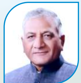
General (Dr.) V. K. Singh PVSM, AVSM, YSM (Retd.) Hon'ble Minister of State for Road Transport & Highways and Civil Aviation Government of India