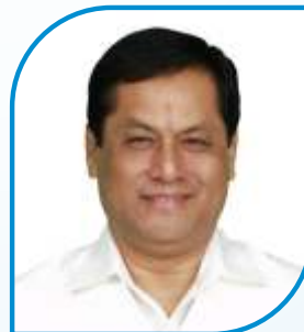
Shri Sarbananda Sonowal* Hon'ble Minister for Ports Shipping and Waterways Government of India