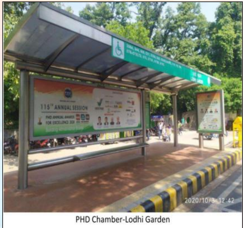
PHD Chamber-Lodhi Garden