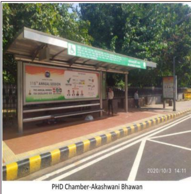
PHD Chamber-Akashwani Bhawan