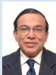
Mr Pratip Chaudhuri, Former Chairman, SBI

The glory has to be brought again to manufacturing sector as that is where the core strength of the country is. Though the repo rate has been reduced but its effect has not been passed on to the customers. The highest market capitalization has been by banking sector. The government initiative of allocation of Rs. 70000 crore for the PSU bank recapitalization is laudable. It is unrealistic to believe that the budget can solve everything, as it is just a roadmap or a broad picture.