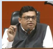
Mr Gopal Krishna Agarwal, National Spokesperson of BJP (Economic Affairs)

Macroeconomic parameters like inflation, GDP growth rate, forex reserves etc are in the good terrain. The investment should be for asset creation and infrastructure creation so that it will create demand in the economy and liquidity into the whole economic setup. At this time, disinvestment of large PSUs is only source from where revenue can be generated by the government and the same can be a source for government expenditure.