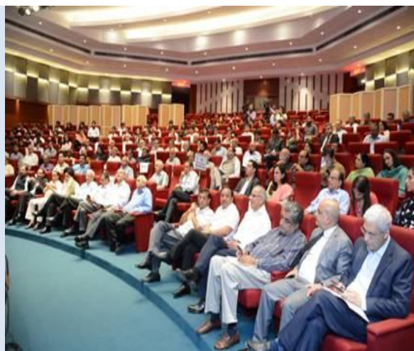
Audience Watching the Budget Viewing Session 2019-20