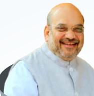
SHRI AMIT SHAH Hon'ble Minister for Home Affairs Government of India

"Homeland security is one of the important areas for the nation's economic development"