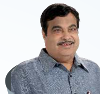
SHRI NITIN GADKARI Hon'ble Minister for Micro, Small and Medium Enterprises and Road Transport and Highways Government of India

"Country's security, welfare of people Government's priority"