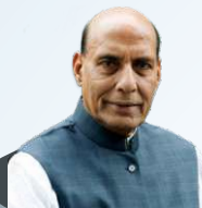
SHRI RAJNATH SINGH Hon'ble Raksha Mantri Government of India

"A strong Indian defence industry will not only make India more secure. It will also make India more prosperous."