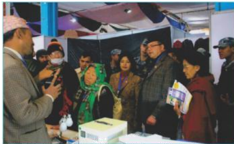
CPN UML leader Jhalanath Khanal visiting Nepal Chamber Expo