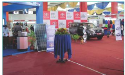
True consumer and trade event