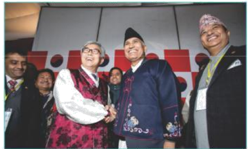
Korean Ambassador, Hon'ble Finance Minister and President of NCC