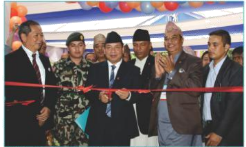
H.E. Vice President of Nepal Nanda Bahadur Pun inaugurating the 2nd expo.