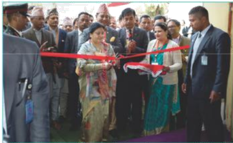
H.E. President of Nepal Bidhya Devi Bhandari inaugurating the 3rd expo.