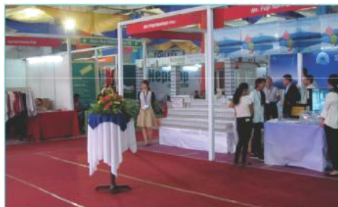
Title Sponsor Mt. Fuji Springs Inc., Japan at Nepal Chamber Expo