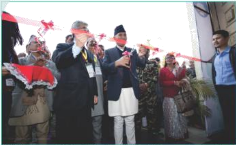
Hon'ble Finance Minister Bishnu Prasad Poudel inaugurating the 1st expo.