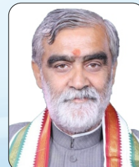
Shir Ashwini Kumar Choubey* Hon'ble Minister of State, Ministry of Health & Family Welfare, Govt of India