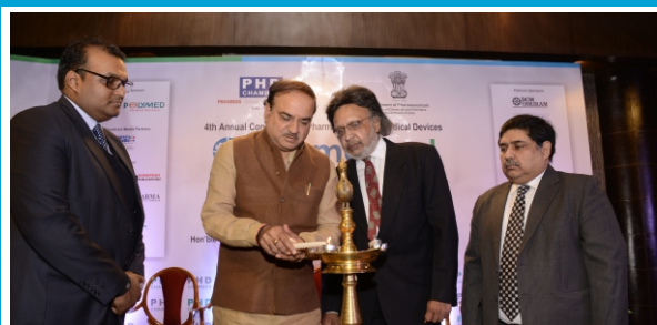
PharmaMed 2015 Lighting by Shri Ananth kumar* Hon'ble Union Minister of Chemicals & Fertilizers