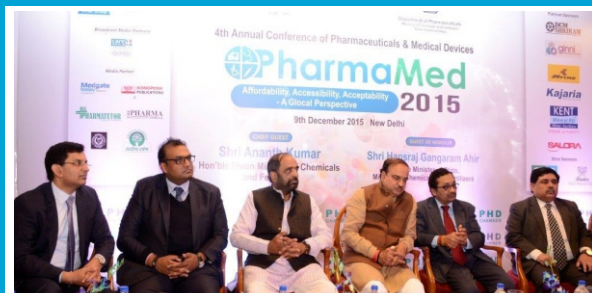
PharmaMed 2015 Lighting by Shri Ananth kumar* Hon'ble Union Minister of Chemicals & Fertilizers