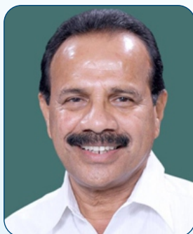
Shri D.V. Sadananda Gowda Hon'ble Minister, Chemicals & Fertilizers Statistics and Programme Implementation Govt. of India