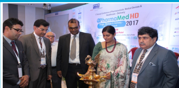
PharmaMed 2017 Lighting by Smt. Anupriya Patel Hon'ble Minister of State, Ministry of Health & Family Welfare, Govt. of India