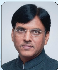
Shri Mansukh Lal Mandaviya* Hon'ble Minister of State Ministry of Chemicals & Fertilizers, Govt of India