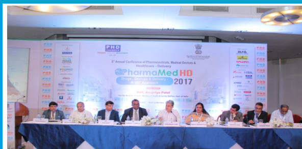
PharmaMed 2017 Shri Sudhansh Pant, IAS, Joint Secretary Department of Pharmaceuticals, Ministry of Chemicals & Fertilizers Govt. of India