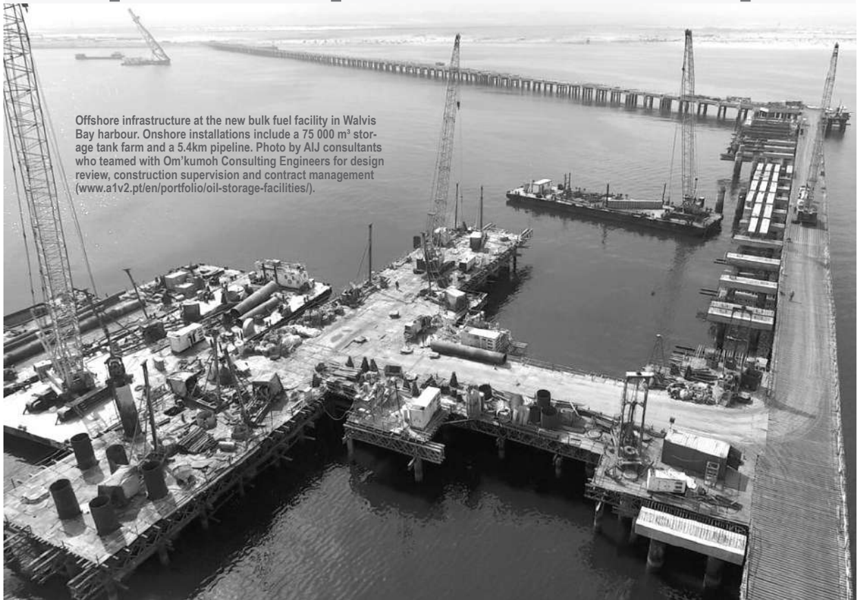
Offshore infrastructure at the new bulk fuel facility in Walvis Bay harbour. Onshore installations include a 75 000 m 3 storage tank farm and a 5.4km pipeline.