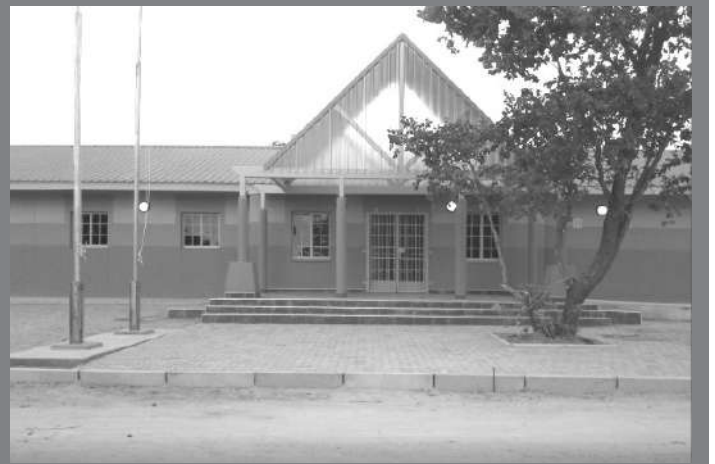
The Oshikunde Combined School and hostel, built by the Nexus Group in 2013 at a cost of N$104-m, is now undergoing an upgrade

FOURTEEN OFFERS FROM N$51-M TO N$73-M FOR ONKUMBULA COMBINED SCHOOL HOSTELS AND 13 OFFERS FROM N$54.8-M TO N$78-M FOR OSHIKUNDE COMBINED SCHOOL UPGRADE - PAGE 5