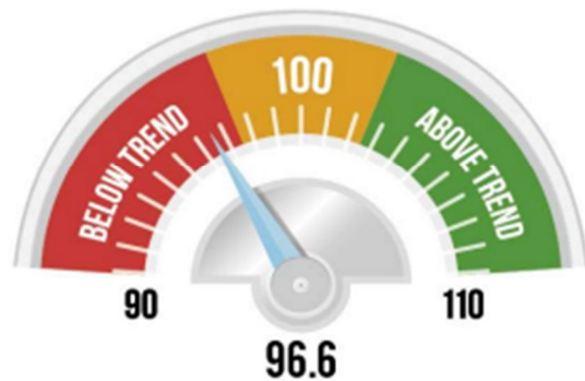
Index history, trend = 100