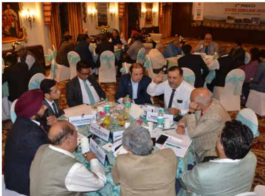
Discussions between Expert Committees and State Chapters