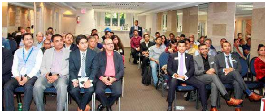
Participants at the event

for business. India's growth is generating new opportunities for businesses to invest in India. As a developing economy it needs more power. Indian government has set a target to achieve over 175 GW of power through renewable energy resources by the year 2022. Canada does have a robust technology in the sector which can be helpful for India. He invited