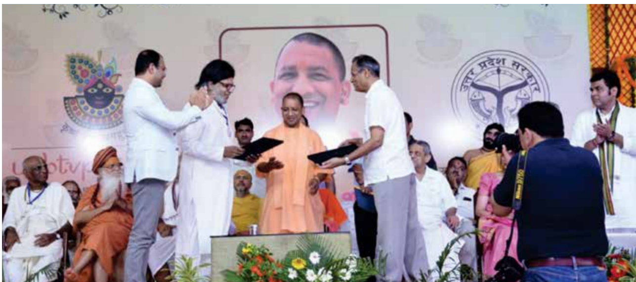
Exchange of MoU between PHD Chamber and UPBTVP

PHD Chamber signed a MoU with Uttar Pradesh Braj Teerth Vikas Parishad as an Industry Partner on August 31, 2018 at Mathura to assist in developing the Braj Region through its industry members.