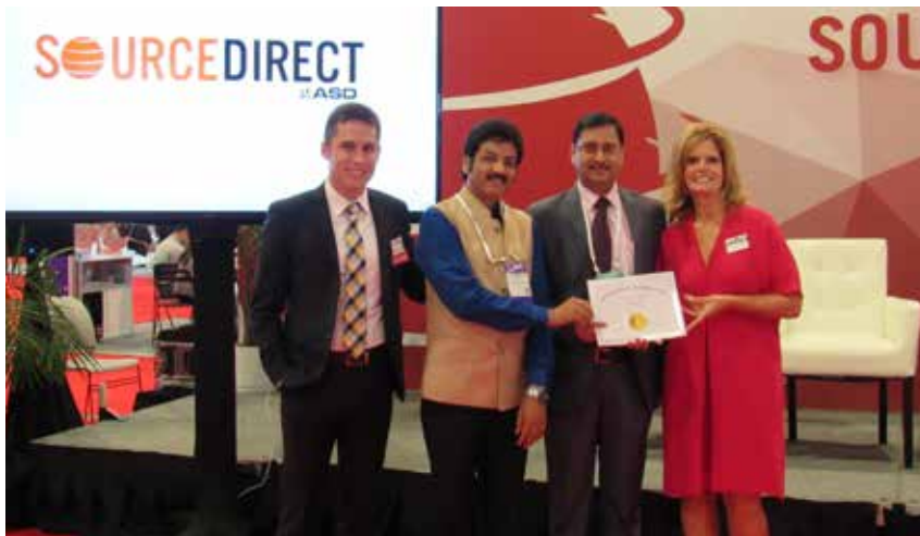
Certificate of Appreciation awarded to PHD Chamber by Emerald Expositions, LLC

products, coir door mats, personal protection equipments, furniture for outdoor, garden furniture, rugs & carpets, made up bags; metal furniture items, candle stands; hand embroidered home furnishings and home decorations; gifts and souvenirs.