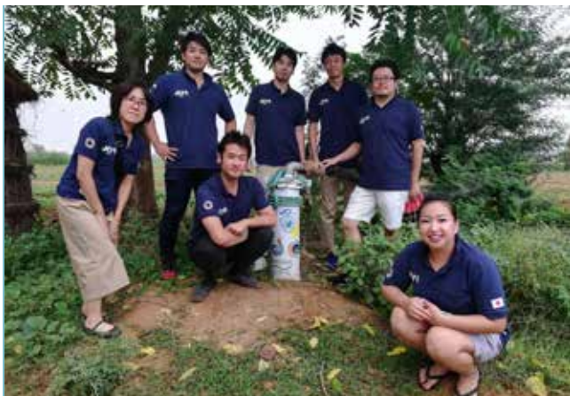
JCI Team Visit in Village Jalalpur

As a part of the project, community drinking water facility has been established in two villages: one in Mewat village Jalalpur in Tauru Block and another in Pataudi block village Ramnagar. Besides this, new toilet blocks have been constructed and existing toilet facilities refurbished in three Government schools of Sohna. Behaviour change sessions are undertaken regularly with the school children through fun way learning method. Drawing competitions, eco rally, animated audio, visual presentations, educational games are being conducted for same.