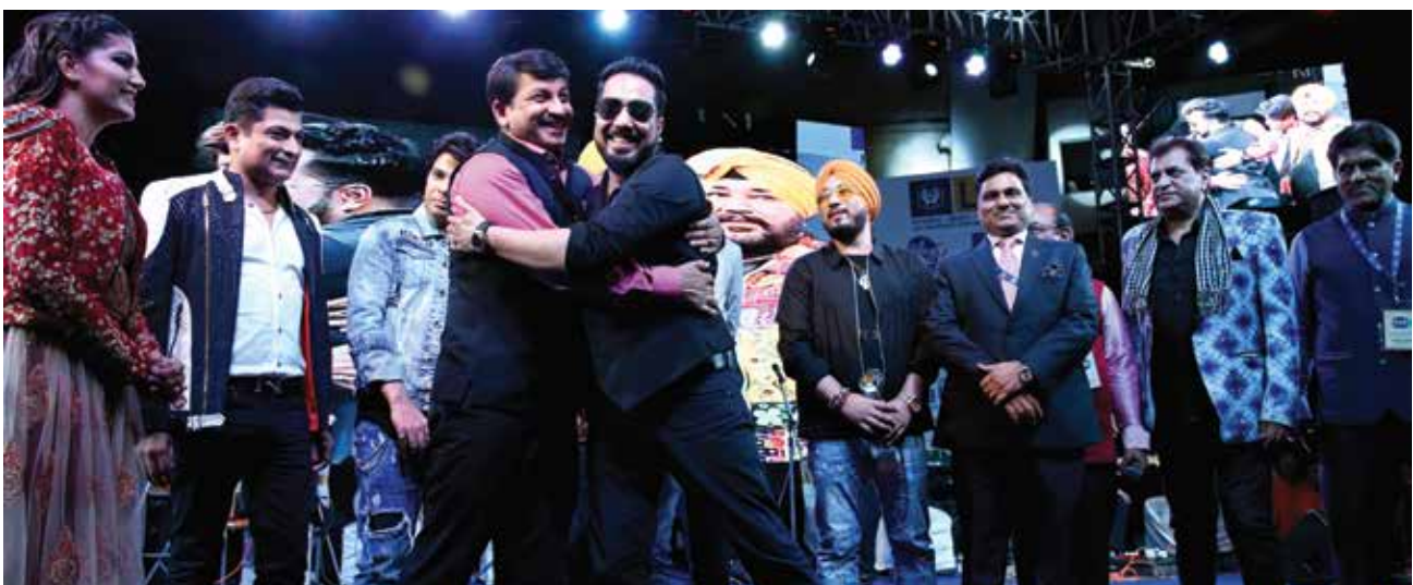
Mr. Manoj Tiwari, Member of Parliament- Lok Sabha and BJP President and Mr. Mika Singh, Singer