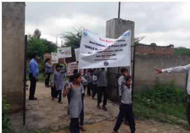
Eco Rally by the students in Kiranki