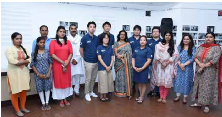
Meeting with JCI Team

PHDRDF has been actively conducting free health camps for the low income population in various geographical locations across the country to increase access to healthcare. A team of qualified Doctor, ANM, Lab Technician and project coordinator are present for each camp and are responsible for its success. Emphasis is given on generating awareness among the community on sanitation & hygiene, child & maternal health, waterborne diseases, communicable diseases and other geography based medical problems.