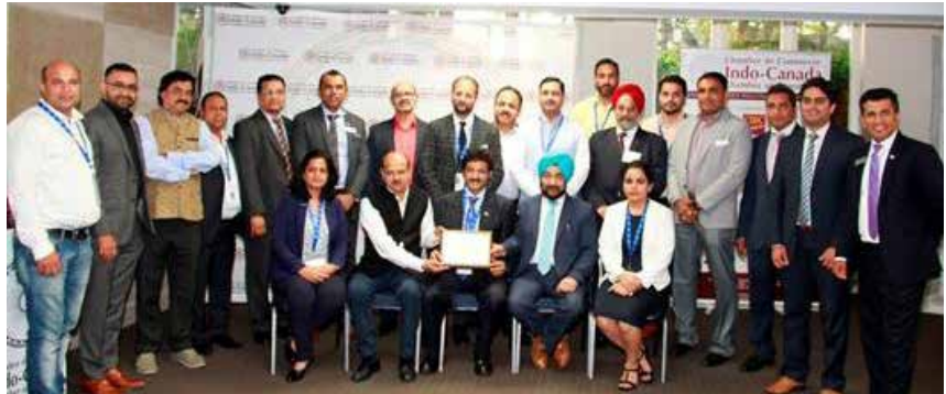
ICCC Board with the delegation