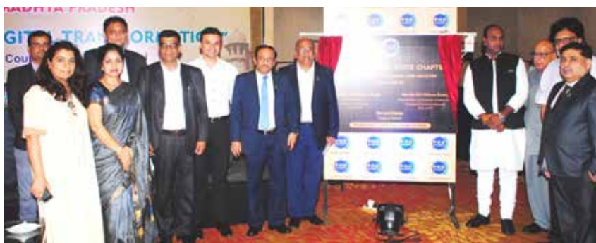
EC Members (MP State chapter) with Chief Guest and President, PHD Chamber at the Launch Ceremony