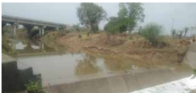
Dam at Indore after First Rainfall

PHDRDF and Coca Cola Foundation, Atlanta have come together to promote sustainable solutions for water resource management with surface water conservation and ground water recharge through construction of six check dams in Indore, Dhar and Hoshangabad districts of Madhya Pradesh. So far, construction of three check dams have been completed and dam in district Dhar is in full progress. These check dam will hold 457,950 cu mts of water and will impact around 7800 people's life.