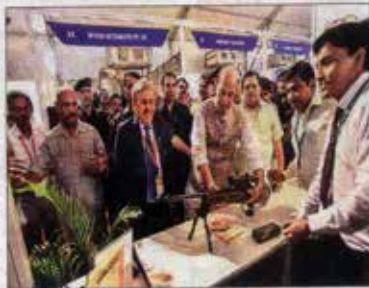
Rajnath Singh at Defence & Homeland Security Expo and Conference

Inaugurating a three-day Defence and Homeland Security Expo and Conference 2018, organised by the PHD Chamber, Singh said the utility of drones in ensuring security has been found to be necessary and the Central government will soon bring out a policy on their comprehensive usage in the country. "I am fully confident that drones will be very useful for our security forces. I have seen their capabilities and utility in the conduct of anti-Naxal operations," he said. The Home Minister then