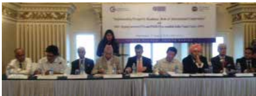
PHDCCI President & Delegates met MAN Leadership

The PHD Chamber delegation also met the Leadership of Management Association of Nepal (MAN) at Hotel Annapurna, Kathmandu. During the meeting, it was decided that PHDCCI and