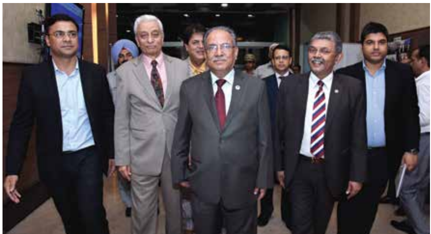
Chief Guest, Prachanda at PHD House, New Delhi

The Centre aims to facilitate greater private sector contribution for accelerated inclusive economic development of Nepal