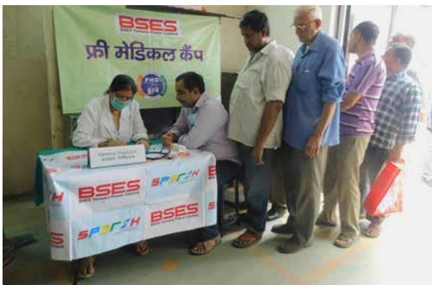
Doctor examining the Patient at one of the Health check up Camp

BSES Yamuna Power Ltd. collaborated with PHDRDF and has been extended for another one year to implement a Mobile Health project in Central and East Delhi. The objective of the project is to provide basic health care services to the low income residential clusters of East and Central Delhi. During the project, a total 144 health camps will be organized in 16 locations and approx. 17,280 patients will be benefitted. During the period, total 12 health camps were organized and 1458 patients were provided with free medical counseling and medicines.