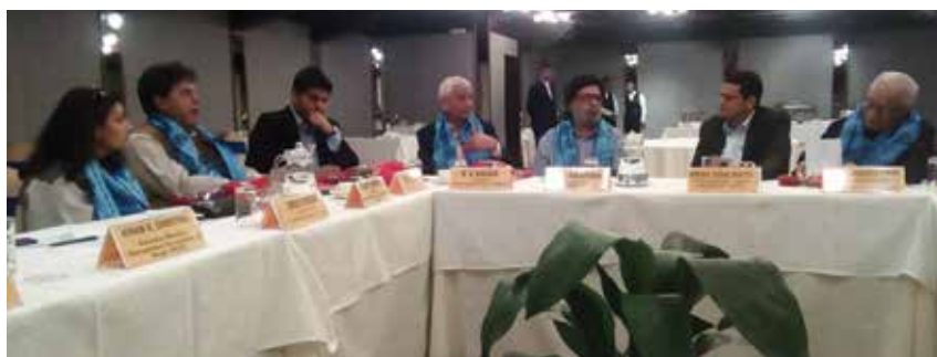
PHDCCI President & Delegates met MAN Leadership