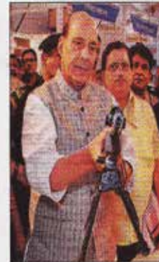
Rajnath Singh visits a stall at 'Defence & Homeland Security Expo and Conference', in New Delhi on Thursday.

"Organised crime and terrorism are the biggest challenges for us. We know that these elements are using new technology and sophisticated weapons. That