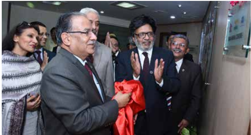
Former Prime Minister of Nepal, Mr. Pushpa Kamal Dahal 'Prachanda', Chairman, Nepal Communist Party with PHDCCI Leadership during the inauguration of India-Nepal Centre

Chief Guest, Former Prime Minister of Nepal, Mr. Pushpa Kamal Dahal 'Prachanda', Chairman, Nepal Communist Party assured India Inc. that the new