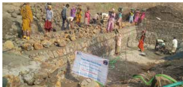
Under Construction Dojda Wala Check Dam, Partapgarh

PHDRDF and Clean Wind Power Group Company of Hero Future Energies Ltd. have come together to construct a water harvesting structure in district Pratapgarh of Rajasthan. Two check dams have been constructed in Pratapgarh in the vicinity of their manufacturing unit. These check dams will benefit around 6027 people in 3 villages. One check dam 'Dojda Wala' is under construction. Water holding capacity of 'Dojda Wala' Check Dam will be 46800 cubic meter.