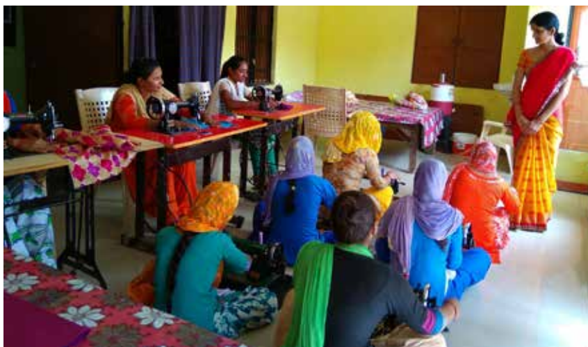
Stitching Training At Donaldson Skill Center, Sohna

PHDRDF with the support of Donaldson India Filter Systems Pvt. Ltd. is implementing a project titled 'Skill Development of Women and Adolescent Girl' in Mohammadpur Gujjar village, Sohna Dhani, Gurugram, Haryana. The project is continuously being run since 2016. Around 80 girls are trained in cutting & tailoring and beauty culture. The objective of the program is to equip women and young girls with income generation skills through skill development training in Cutting & Tailoring and Beauty Culture and to develop their personality through English Speaking and Soft Skills.