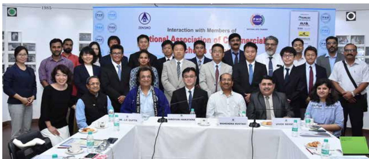
Japanese Delegation at PHD Chamber