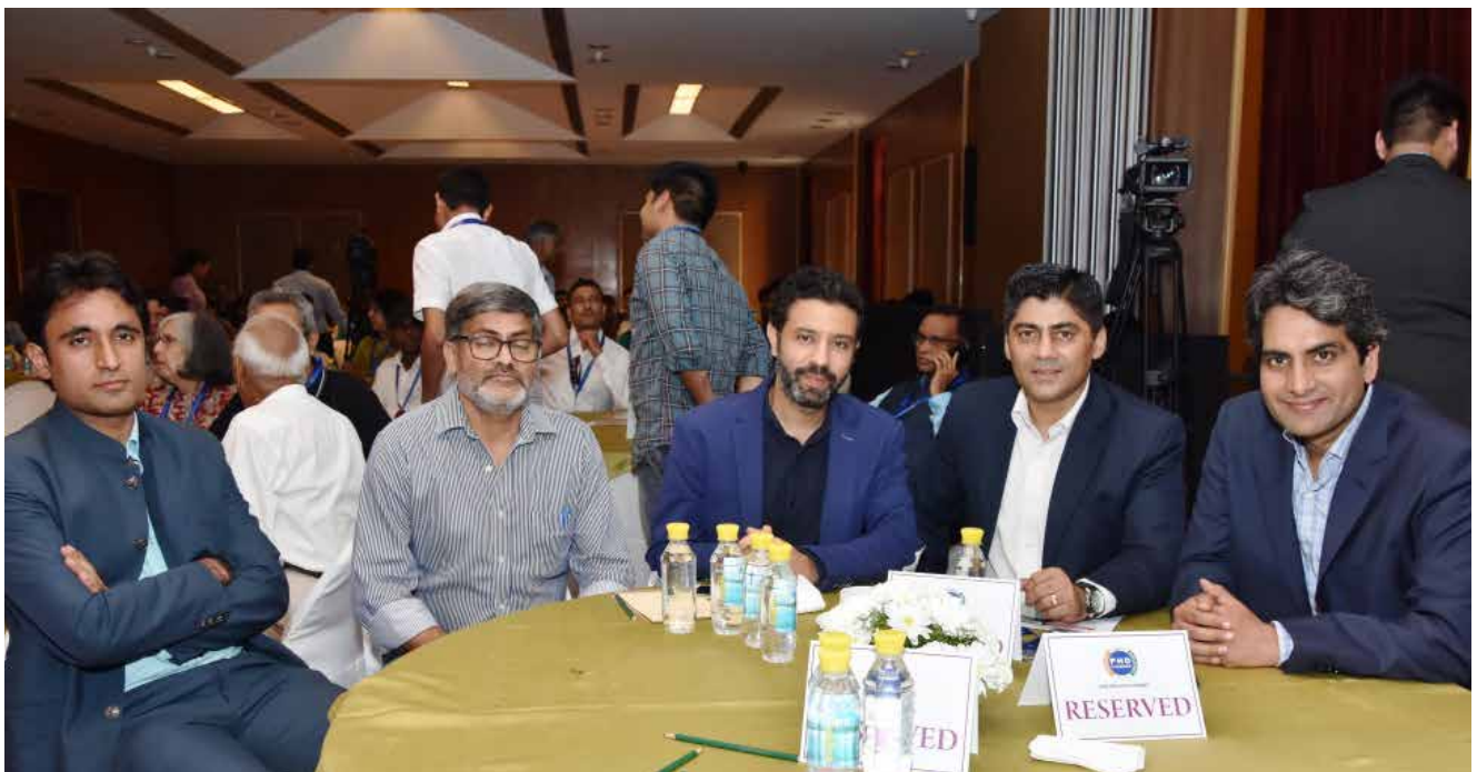
Elite Speakers from the Media Industry