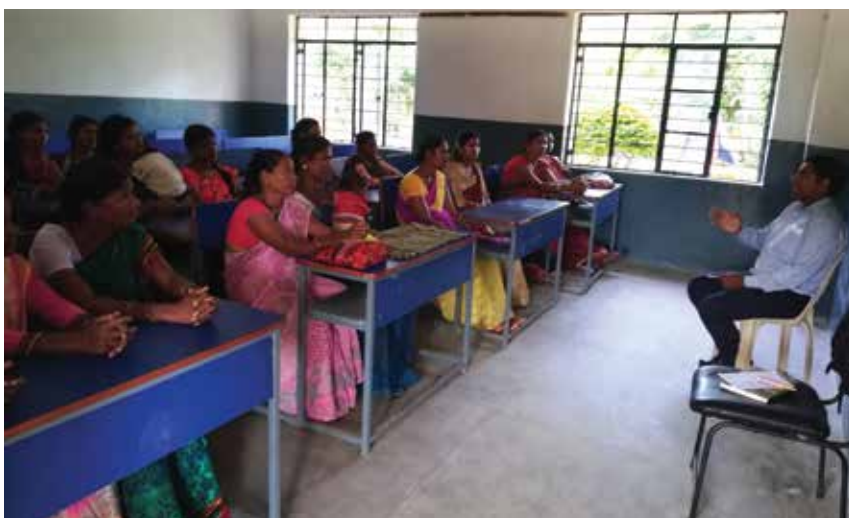
Women Mobilized for SHG in Khunti