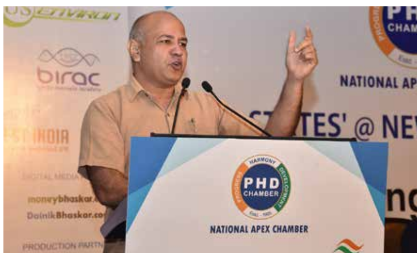
Mr. Manish Sisodia, Deputy Chief Minister, Government of NCT - Delhi addressing at inaugural session

He also emphasized that the society in Delhi is strong in every aspect because it is able to absorb and assimilate different and diverse cultures within its ambit; however, its governance mode is filled with various challenges which need to be addressed to empower Delhi in terms of decision-making that will lead to overall advantages of its citizens.