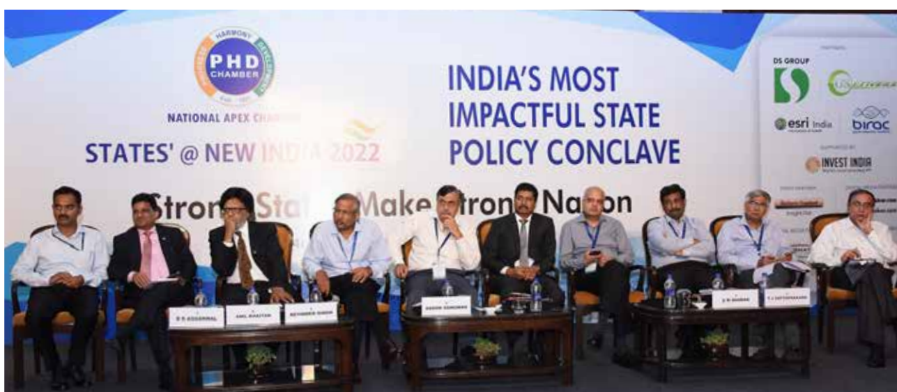
The parallel sessions on states' which hosted the B2G meetings between the government representatives from Haryana, Punjab, Uttarakhand, Delhi and the participating industry entities