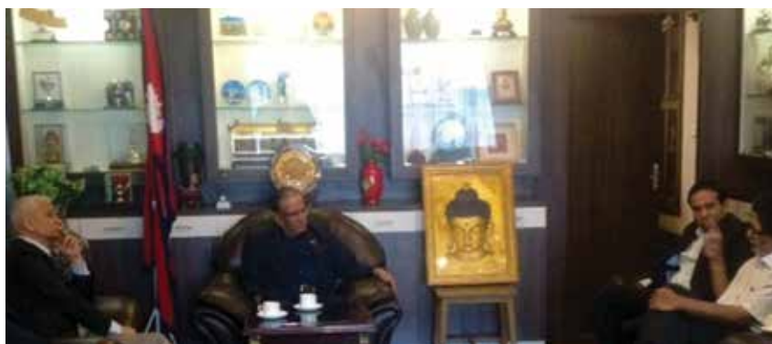
PHDCCI President and INC Chairman met Prachanda, Nepal's Former Prime Minister & Chairman, Nepal Communist Party