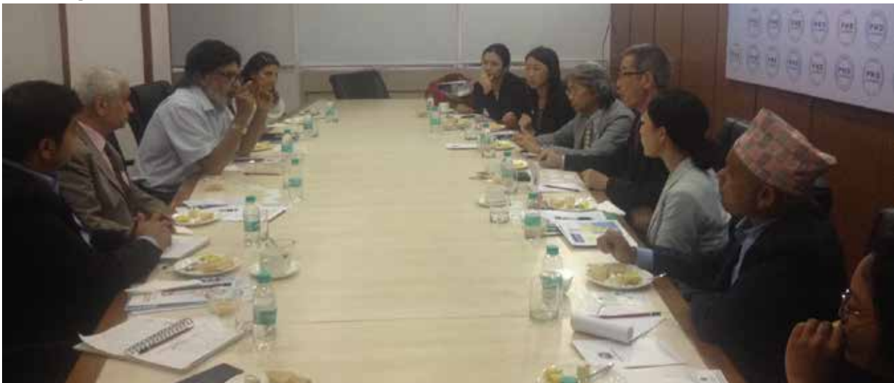
PHDCCI Leadership interacts with the Delegation

K eeping in focus the aim for greater level of India-Nepal-Japan trilateral cooperation, an interactive session was hosted by the India-Nepal Centre with the visiting Japanese delegates from