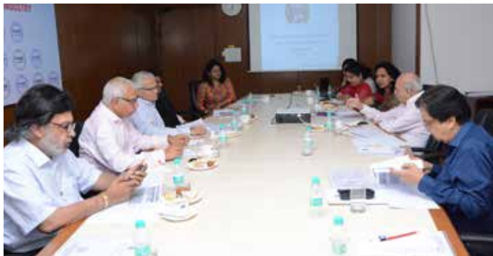
PHDRDF-Governing Body Members Meeting held on 09.08.2018