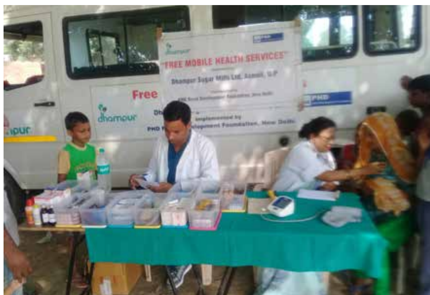
Generic Health camp in Asmoli