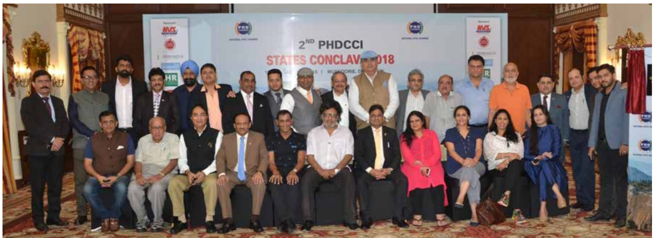
Group Photo during Inauguration of Uttarakhand State Chapter