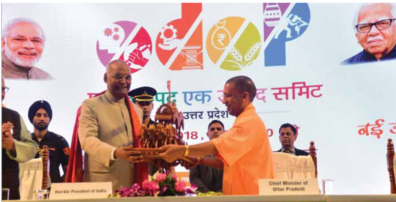
Mr. Yogi Adityanath, Chief Minister of Uttar Pradesh presenting a memento to Mr. Ram Nath Kovind, Hon'ble President of India

The Hon'ble President also unveiled ODOP help line's toll free number (1800-1800-888) and website of the ODOP. Bank loans worth over Rs. 1006.94 crores were distributed to 4095 SME entrepreneurs to expand their units. A coffee table book on ODOP was also released by the Governor and its first copy was presented to the President.