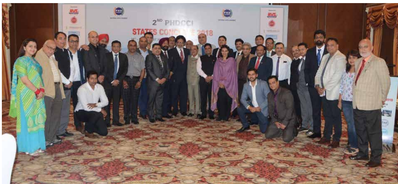
Group Photo of PHDCCI 2nd State Conclave