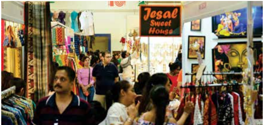
A view of the exhibition