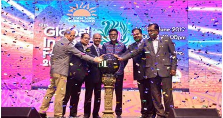
Digitally opening of the Mega Inaugural Ceremony by pressing the electronic button collectively by the Chief Guest, Dr Xavier Jayakumar Hon'ble Minister of Water, Land and Natural Resources, Govt. of Malaysia and Guest of Honour H.E. Mr. Mridul Kumar, High Commissioner of India in Malaysia in the presence of other dignitaries

H.E. Mr. Mridul Kumar, High Commissioner of India in Malaysia was the Guest of Honour at the inauguration of the India Pavilion held on June 4, 2019 in the presence of various dignitaries' and buyers'. Chief Guest was Dr Xavier Jayakumar, Hon'ble Minister of Water, Land and Natural Resources, Govt. of Malaysia.