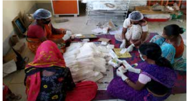
Sanitary Pad being manufacturing by TCI_Antrang SHG women's in Khunti

PHDRDF and TCI Foundation have partnered for the project titled "Enterprise Development - Low Cost Sanitary Napkin Production Enterprise by Women Self-Help Group" which aims to address the dual purpose of economic empowerment for women and provide low cost sanitary napkins to rural women and adolescent girls in and around Jamhar Village, Khunti District of Jharkhand through enterprise development of manufacturing low cost sanitary napkins. Market linkages for the product have been established for the Women SHG and women have started earning out of their SHG.