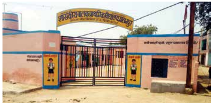
Civil Work in Govt. Primary School, Malanpur is Completed

Teva API India Ltd and PHDRDF have come together for a project - "Aadharsh Vidyalaya- Integrated Development of Government Schools in Gajraula, Uttar Pradesh and Malanpur, Bhind" in Madhya Pradesh. The buildings of both the schools have been upgraded including refurbishing of classrooms, mid-day meal area, sanitation and drinking water facility, playground, proper boundary wall with gate and BaLA. The civil work in both the schools has been completed. Swings and slides in both the schools have been installed. Currently, the schools are closed for summer vacations and recurring activities will be resumed after the schools reopen.