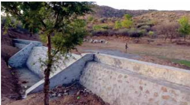
Complete Jagdish wala check dam, Sikar

PHDRDF and Rotary Club of Delhi South Central have again partnered for constructing four check dams. Construction of three check dams – Bagh wala, Ban wala, Jagdish wala has been completed and construction of Rai wala check dam is under progress in village Ladi Ka Bas, Neem Ka thana, Sikar, Rajasthan. These check dams will have the water holding capacity of 1,310,000 cu ft and it will benefit around 3160 people of five villages. The construction of these check dams is likely to be completed soon before the onset of the monsoon.