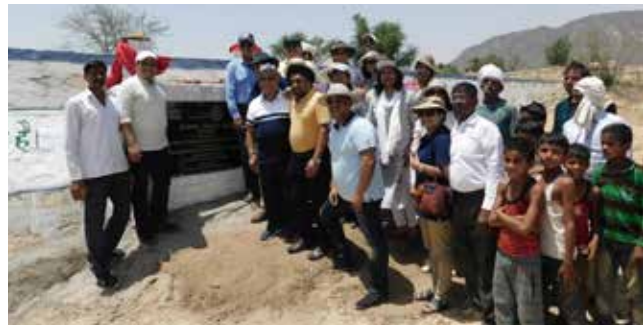
De fluoride system-inauguration ceremony, Sikar