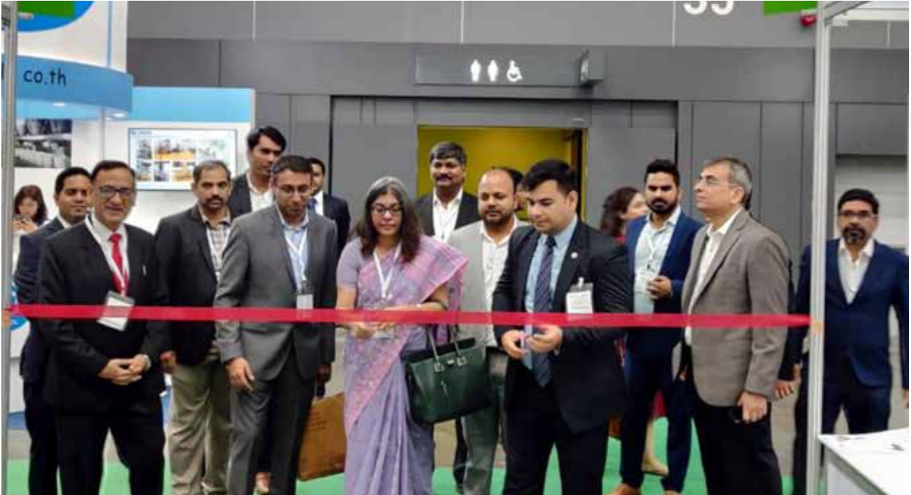
H.E. Ms. Suuchitra Durai, Ambassador of India to Thailand formally inaugurated the India Pavilion on June 12, 2019

P HD Chamber participated in India Pavilion at PROPAK ASIA - 27th International Processing and Packaging Exhibition for Asia on June 12-15, 2019 at BITEC, Bangkok, Thailand with 24 exhibitors showcasing food, drinks, pharma processing and packaging technology.