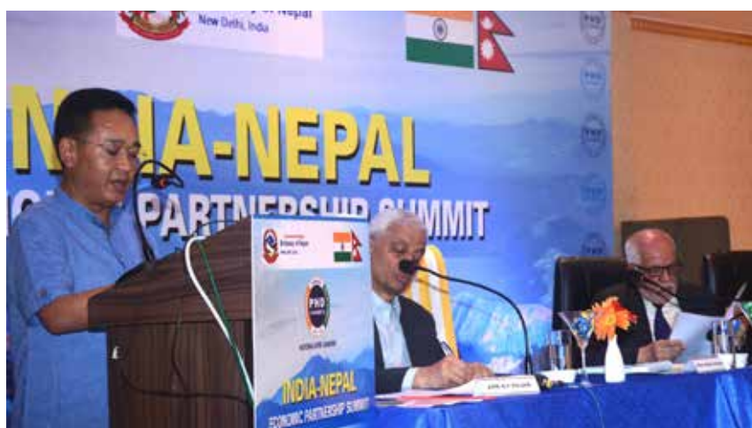
Chief Guest, Mr. Prem Singh Tamang, Chief Minister, Sikkim delivering the keynote address

Chief Guest, Mr. Prem Singh Tamang, Chief Minister, Sikkim shared his perspectives on the opportunities that are prevalent in Sikkim and the need for collaborative efforts for making a framework of comprehensive regional and sub-regional economic co-operation.