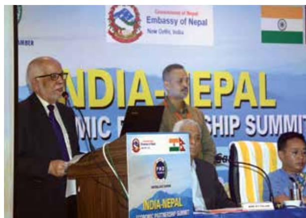
HE Mr. Nilambar Acharya, Ambassador of Nepal shared his reflections to deepen the economic cooperation between India and Nepal

HE Mr. Nilambar Acharya, Ambassador of Nepal pointed out the sectors where India-Nepal co-operation can be boosted through proactive and sublime "East Connection" to achieve the desired goals for economic development – energy; infrastructure; tourism; agriculture & food processing; healthcare; education; skill development & start-ups and services.