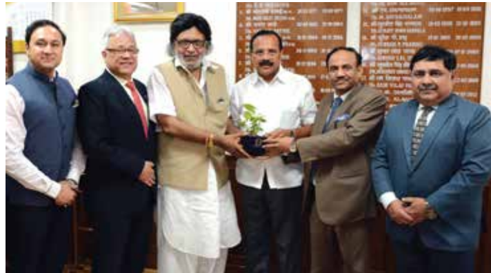
Chief Guest for the Annual Health Conference of PHDCCI- PharmaMed HD 2019.