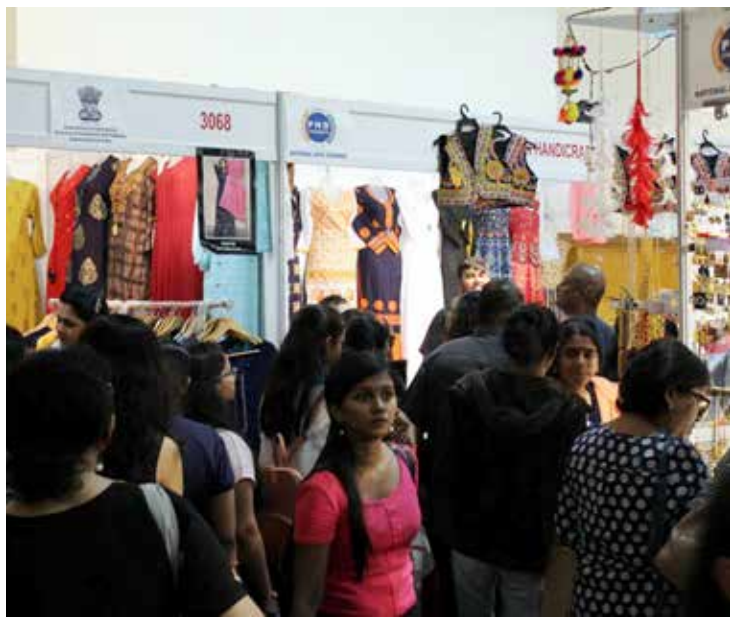
A view of the exhibition