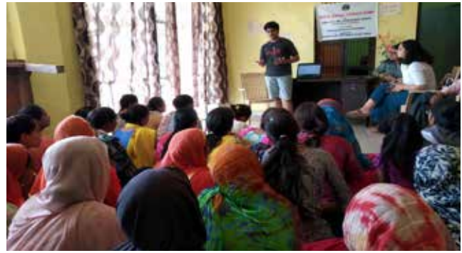
Mobile Digital technology camp conducted at Donaldson centre, Gurugram

PHDRDF in collaboration with Donaldson Filters India Pvt Ltd is running a Skill Development Centre since the last three years in village Mohammadpur Gurjar, Sohna block, Gurugram. Till date, a total of 185 students in both courses have successfully completed the training. Currently, two batches consisting of 20 girls in each batch for Cutting & Tailoring and Beauty Culture courses are undergoing training that will be completed in June 2019. A Mobile digital literacy camp was also organized at Donaldson Skill Development Centre to make the girls aware about mobile technology.