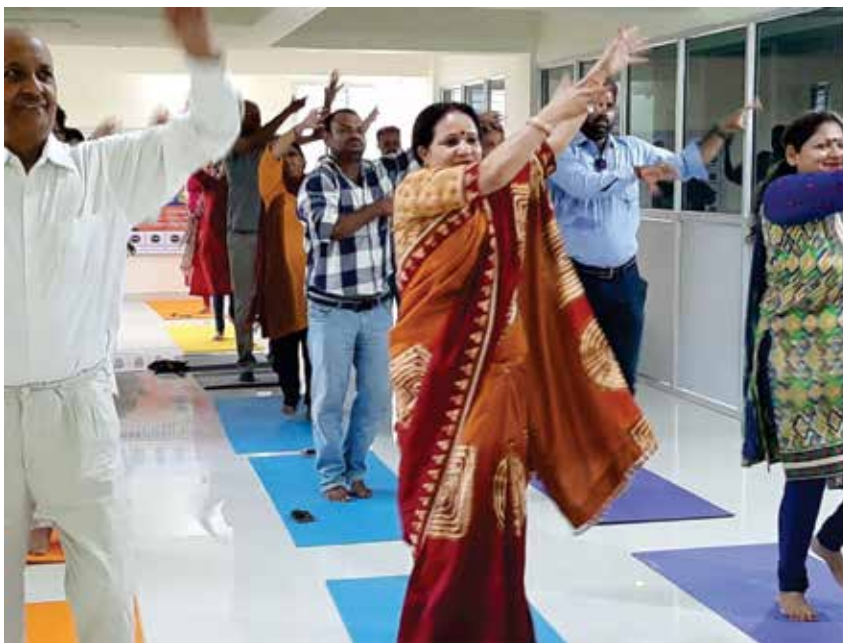
Members Practicing Yoga