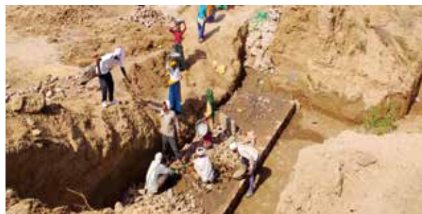
Shyamsa wala check dam, Alwar 60% work has been completed

PHDRDF, Transport Corporation of India and HEG have come together to construct a check dam 'Shyamsa Wala' in Hajipur, Alwar, Rajasthan. The construction work of this check dam is in full progress. This check dam will have 50,400 cu mtr water holding capacity and it will benefit 4650 people of the village.