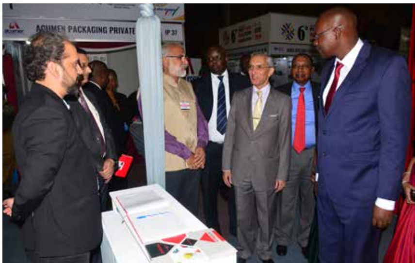
H.E. Mr. Rahul Chhabra, High Commissioner of India in Nairobi meeting Indian exhibitors after inauguration of exhibition

A Buyers Sellers Meet was also organized for the exhibitors on June 26, 2019 at Hotel Golden Tulip Westland that was attended by exclusive buyers from Kenya. The Buyers appreciated the range of Indian machineries and technologies showcased by the exhibitors. As per the feedback received from Indian exhibitors, spot business worth Rs 15 crores was transacted and generated leads as well. The exhibitors are hopeful that these leads will be converted into confirmed orders in future.