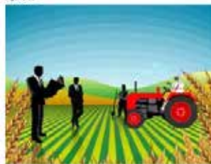
Nirmala Sitharaman indicated for private investments in renewable energy sector associated with agriculture

NEW DELHI: The government plans to nurture agri-entrepreneurs to give an impetus to farming in the country.