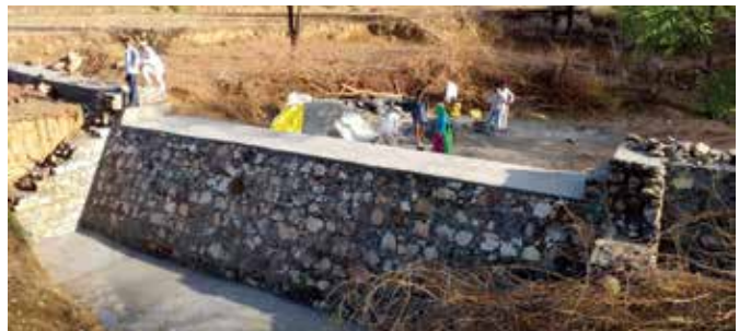
Pali wala check dam, Kotputli, 80% work has been completed

PHDRDF and FMS have partnered for the first time to construct a check dam 'Paliwala check dam' along with laying of pipelines for drinking water distribution in Sirsodi ki Dhani Village in Kotputli, Jaipur. The construction of this check dam is in progress. This check dam will have 650,000 cu ft which will impact the lives of 1022 people of one village.