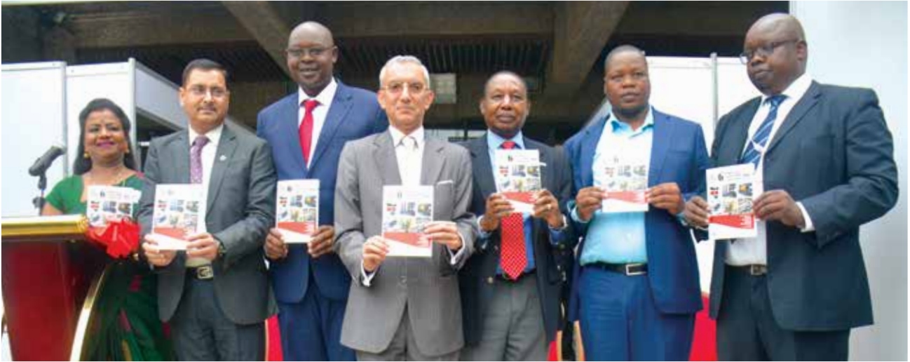
Releasing of Event Guide, Director of 6th Print Pack, Sign Expo and Corrugated Expo

P HD Chamber organized a national level participation from India at the 6th Print Pack, Sign Expo and Corrugated Expo, June 25 – 27, 2019 at KICC, Nairobi, Kenya. More than 100 companies participated in this international trade fair to present a wide range of products. Being one of the biggest printing and packaging sector, signage and allied machineries exhibition in East Africa, many international and local exhibitors showcased their latest technologies.