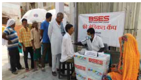
Doctor examining patient at Generic Health camp under Project- BSES Yamuna Power Ltd

PHDRDF and BSES- BYPL have been working for the past four years towards providing health care services to the less privileged community across Delhi. BSES Yamuna Power Ltd. collaborated with PHDRDF for another one year to implement a Mobile Health project in Central and East Delhi. The objective of the project is to provide basic health care services to the low-income residential clusters of East and Central Delhi. During June 2019 to March 2020, a total of 162 health camps will be organized in 18 locations and approx. 19440 patients will be benefited. In the month of June, 1680 patients have benefited through the 14 health camps that were organized.