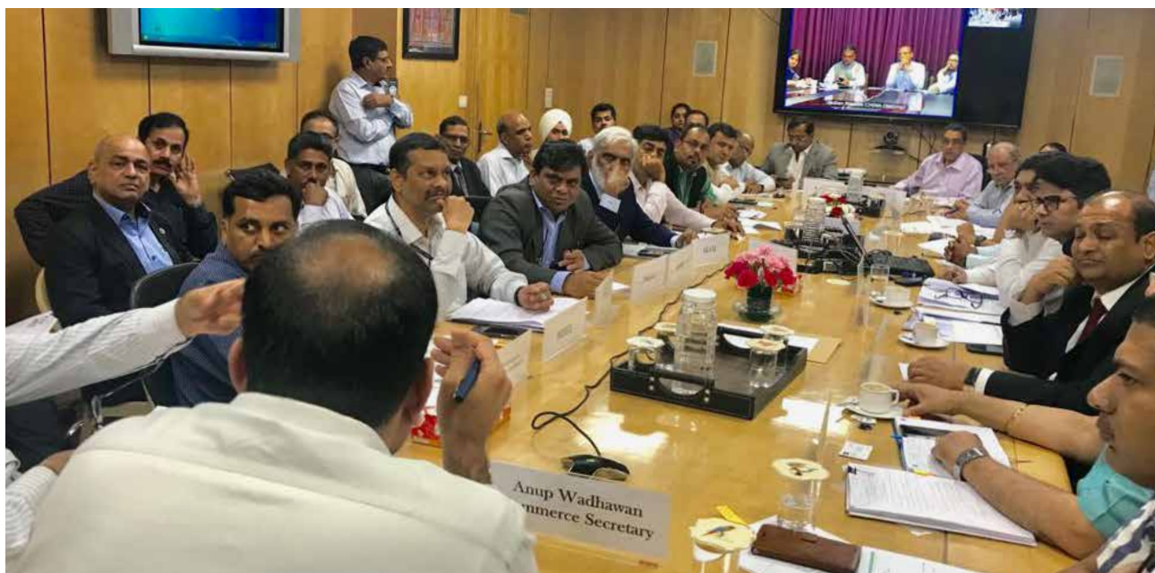
Delegates present at the meeting at Udyog Bhawan, Ministry of Commerce