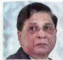
Dipak Misra, former Chief Justice of India

Misra, who was speaking at a conference on 'Intellectual Property through collaborative enforcement', emphasised that while the property of the mind or proprietary knowledge has been recognised over centuries, it has gained significance in the current context due to developments in technology and trade. "The increasing significance of intangible assets in the global economy is forcing business corporations to actively manage their Intellectual Property concepts as a key driver for