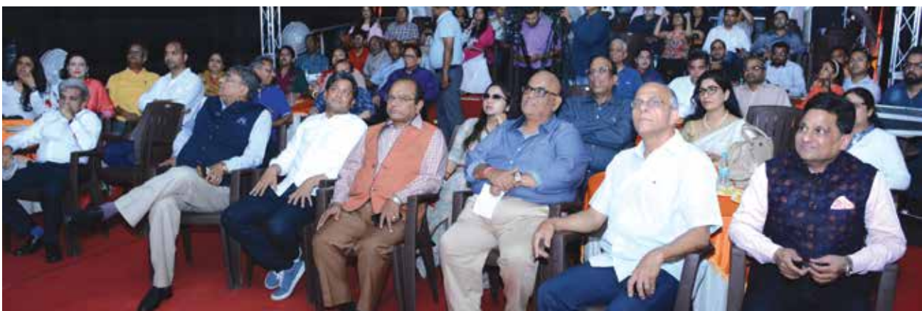
The Presidium with esteemed delegates at the screening

The programme was a joint initiative of the Entertainment & Media Committee; Delhi & NCR Committee; Tourism Committee and the Haryana Chapter.