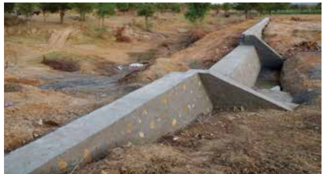
Complete Ban wala check dam Sikar