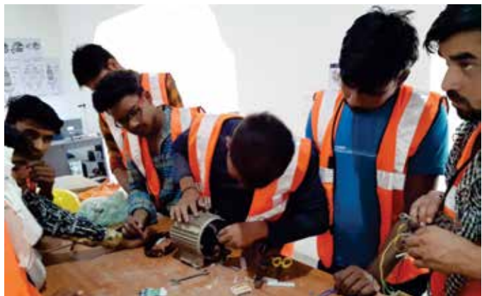
Practical Training of Udaan Skill Development Centre for Electricians

Bry-Air (Asia) Pvt. Ltd. and PHDRDF have come together to implement a project – “Bry-Air Udaan Skill Development Centre for Electrician”. The project is aimed to impart skill development training to the rural youth to improve their income generation capacity. A Training centre for electrical training has been established in Jatoli village near Pataudi, Gurugram. The training started in June with a batch of 20 students in this trade. A total of 40 youth will be trained as electricians.