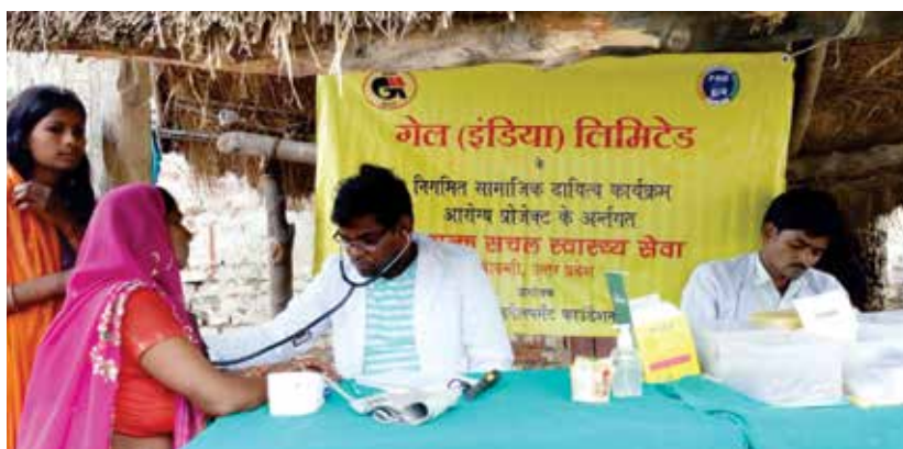
Doctor examining patient at Generic Health camp under Project -GAIL India Ltd

PHDRDF with support from GAIL India Ltd initiated a project on "Mobile Medical Unit" in district Shravasti, Uttar Pradesh. A team of doctor and paramedical staff will conduct 69 health camps in 60 villages through a Mobile Medical Unit. Diagnosis along with various blood tests and free medicines will be provided to the patients. The Mobile Medical Unit will reach out to more than 1600 beneficiaries in a month. During this period, a total number of 23 generic health camps were organized reaching out to a total of 1840 patients.