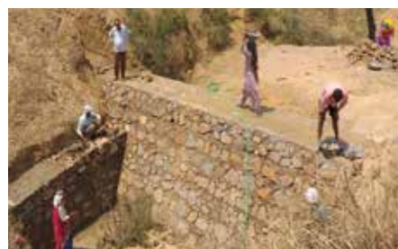
Tigariya wala check dam, Alwar 80% work has been completed

PHDRDF and HTWL have established a partnership to construct a check dam 'Tigariya Wala' at Hajipur, Alwar, Rajasthan. The construction of this check dam is under progress. This check dam will have 200,000 cu ft water holding capacity which will impact the lives of 4500 people.