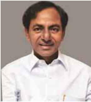
Shri K. Chandrasekhar Rao