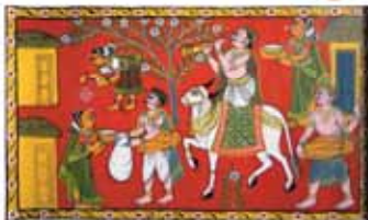
Cheriyal Scroll Painting