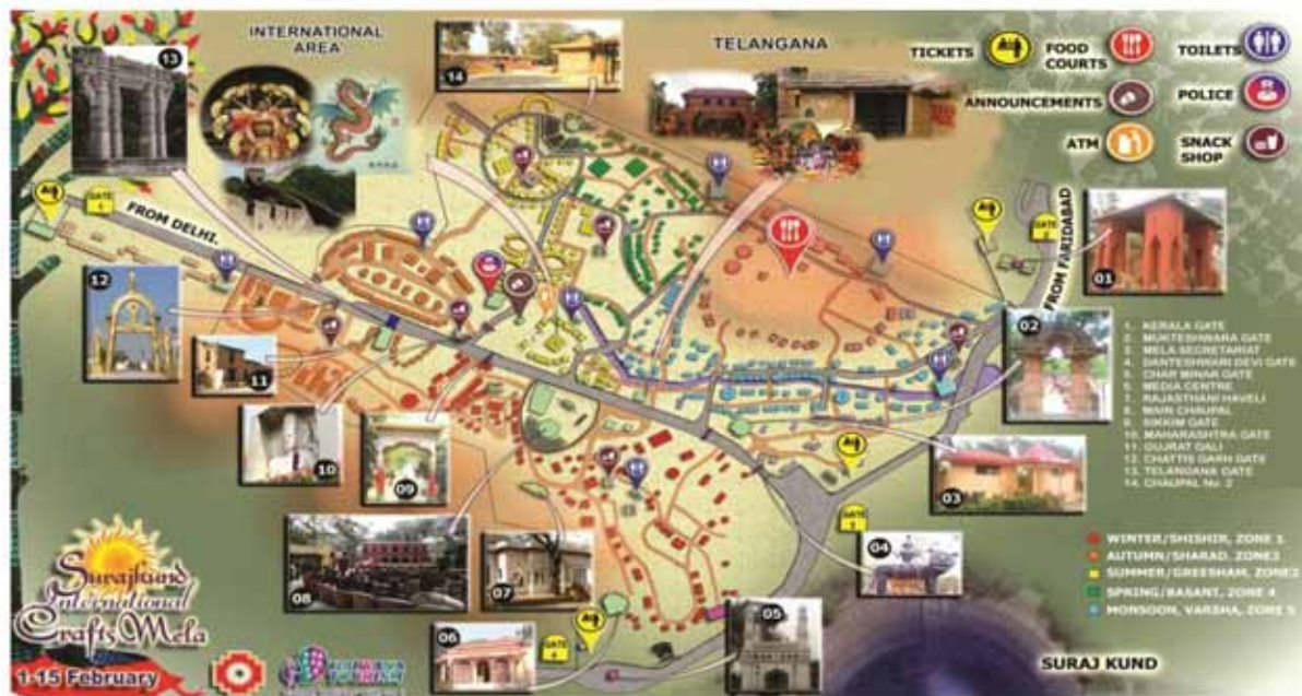
Map of Surajkund Mela

Every year more than a million visitors come to view the ethnicity that the Mela entails. The Mela also celebrates the rhythms of folk theatre and a theme State that makes each visitor marvel. For the 30 th Surajkund International Crafts Mela-2016, the state of Telangana was chosen as the Theme State. At least 20 countries of the world & all the states of India participated in the Mela.