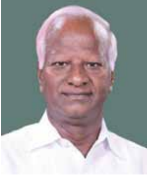
Shri Kadiyam Srihari